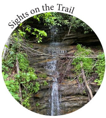
Sights on the Trail