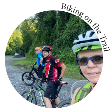
Biking on the Trail